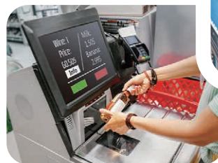
▼ Intelligent Vending