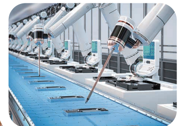
▲ Factory Automation