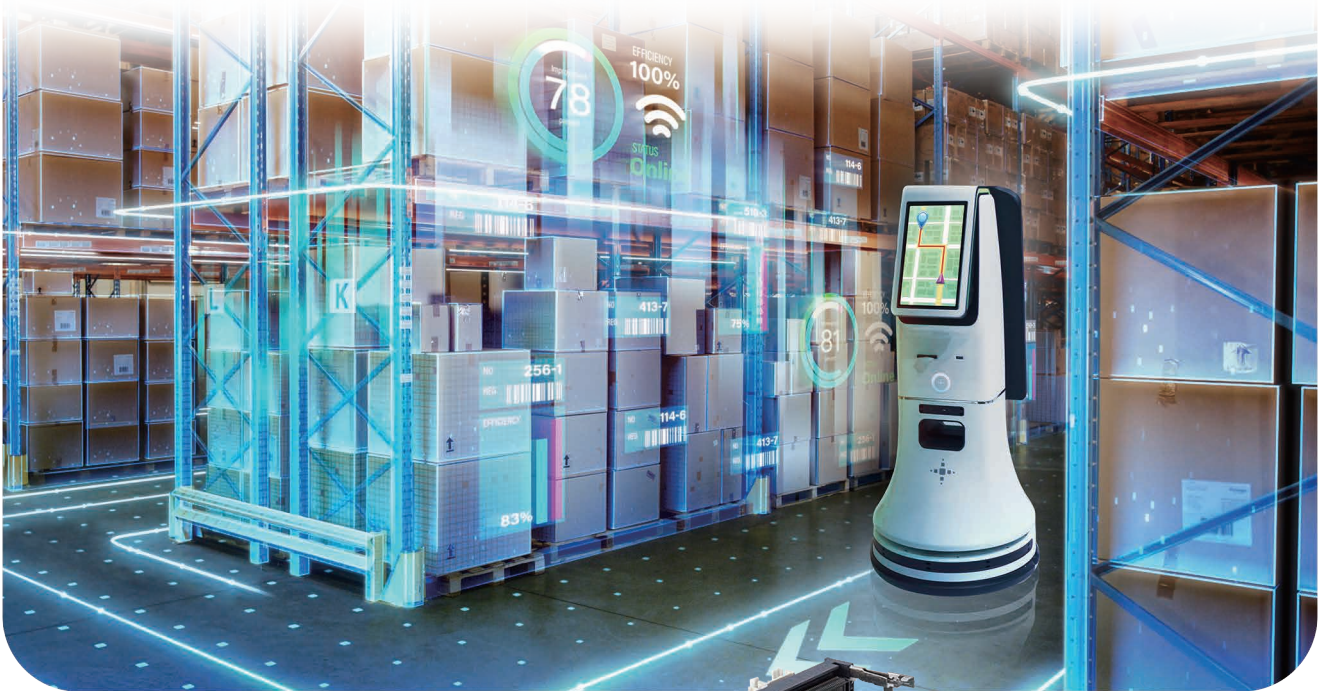
▲ Robotic SLAM

Intel® Core™ Ultra Processor 3.5" Embedded Single Board Computer